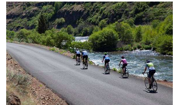
Riders enjoying a scenic ride along the Deschutes River.