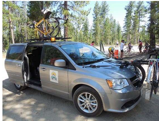
Tour includes vans outfitted for those who want a little help along the way.