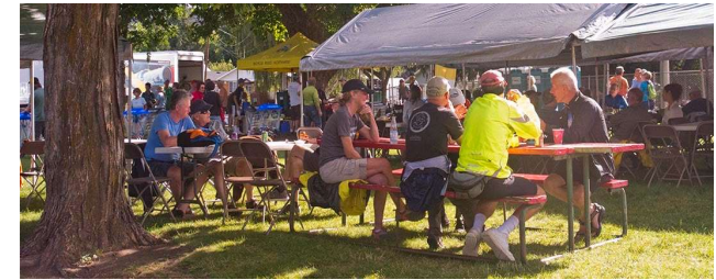
Camp in Naches, Washington